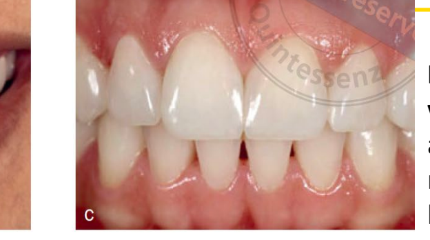
Fig 1. 6-unit maxillary direct composite resin veneers to close diastema and improve esthetics a. pre-op frontal view at rest position: hidden maxillary incisors lead to compromised esthetics b. Pre-op frontal view of patient's smile: multiple diastemas

c. Post-op frontal view after 6-unit maxillary direct composite resin veneers without any tooth preparations