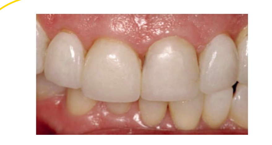
Fig 6. Porcelain veneers after several years of clinical use. Marginal discoloration, recurrent caries lesion on tooth #9 and gaps due to deficient bonding around dentin margins. The veneers on teeth #9 and #11 have already been repaired with composite resin.

Fig 3. Periodic maintenance of composite resin veneer on lateral incisor #7 and #10 . -Composite restoration of tooth #7 before (a) and after (b) periodic maintenance; -Composite restoration of tooth #10 before (c) and after (d) periodic maintenance.